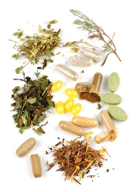
dietary supplements In the U.S., dieatary supplements include vitamins, minerals, botanicals, sports nutrition supplements, weight management products and specialty supplements.